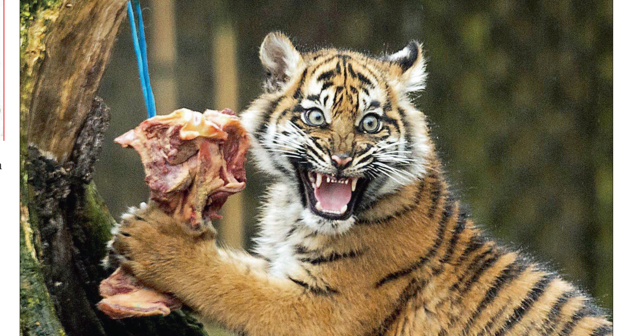
FERAL: Tigers make terrible pets, seemingly wishing to be alone in the bush somewhere.

I would also like to thank you for unleashing the hit squad when those six tigers escaped recently from your